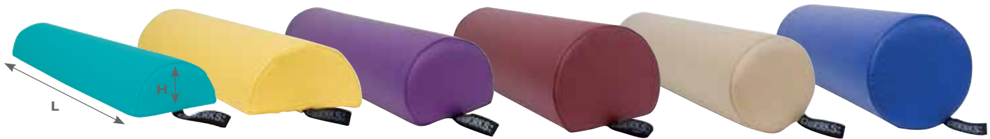
6" Half-round 3"H x 26"L