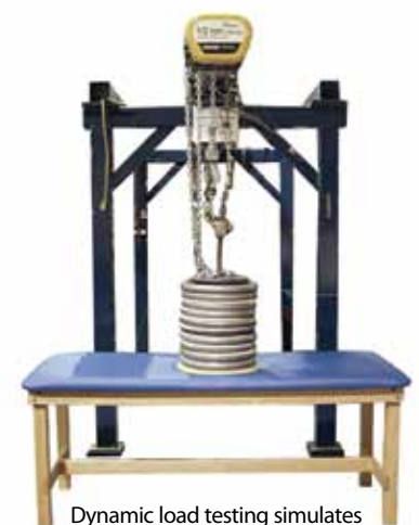
Dynamic load testing simulates real-life hop and drop table use.

We know that your clients, your career and your livelihood depend on the safety, reliability and quality of the products you use. Simply put, nobody else tests like OAKWORKS®, Inc. Every one of our new designs goes through a rigorous, specialized, four-part testing protocol including a dynamic load test, a lateral force test, a stability test and component and cycle tests. This equipment is engineered to exceed all the challenges your table might experience in the field, before it gets there.