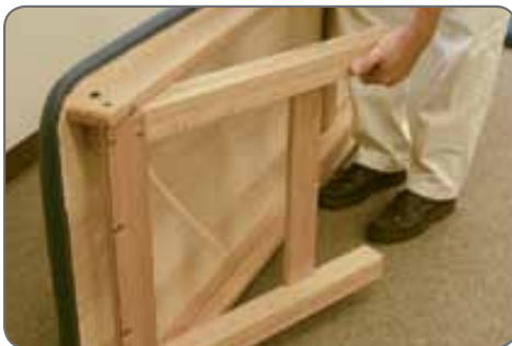
Easy Set Up with Fold Out Legs

Strongest table in its class with a Bariatric Rated 500 lb Weight Capacity!